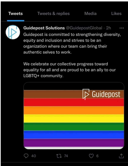
Guidepost Solutions' celebration of Lesbian, Gay, Bisexual, Transgender and Queer (LGBTQ) Pride Month 7

Guidepost is the unclean thing that God says not to touch (II Cor. 6:14–18). Guidepost is the Belial with whom Christ has no concord. The PRC used to know that you don't build a bridge to the world because the world will flood across it into the church. But now the PRC has become wiser than God and says that she may touch the unclean thing and may contract with Belial for her spiritual work.